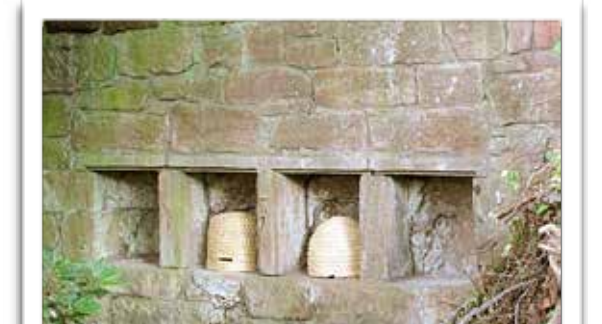
Bothwell Bee Boles

As nature's most efficient pollinators bees were often kept close to orchards and vegetable gardens and until wooden hives were invented bees were kept in skeps (beehives) handmade from straw. Most beekeepers kept their skeps in the open with sacking to provide protection from the elements. In some parts of Britain skeps were