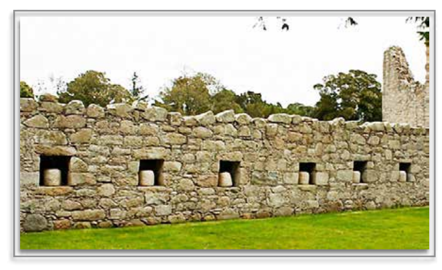
Tolquhon Castle in Aberdeenshire

Bee boles ceased to be used once wooden hives were introduced and those that survive are usually to be found in listed buildings. Nowadays they are sometimes used to hold plant containers. Some excellent examples can be seen at Brodick Castle and below, at Tolquhon Castle in Aberdeenshire.